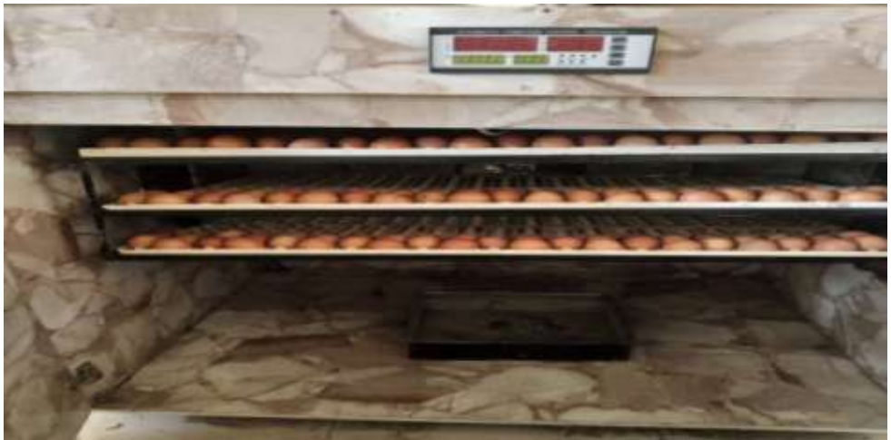
Plate 4.2: Egg incubator when loaded with eggs.