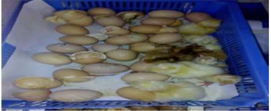
Plate 4.3: Hatching of the Eggs