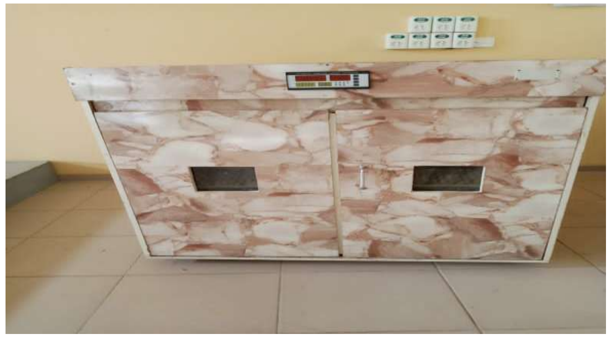
Plate 4.1: Egg Incubator with MDF Plywood.